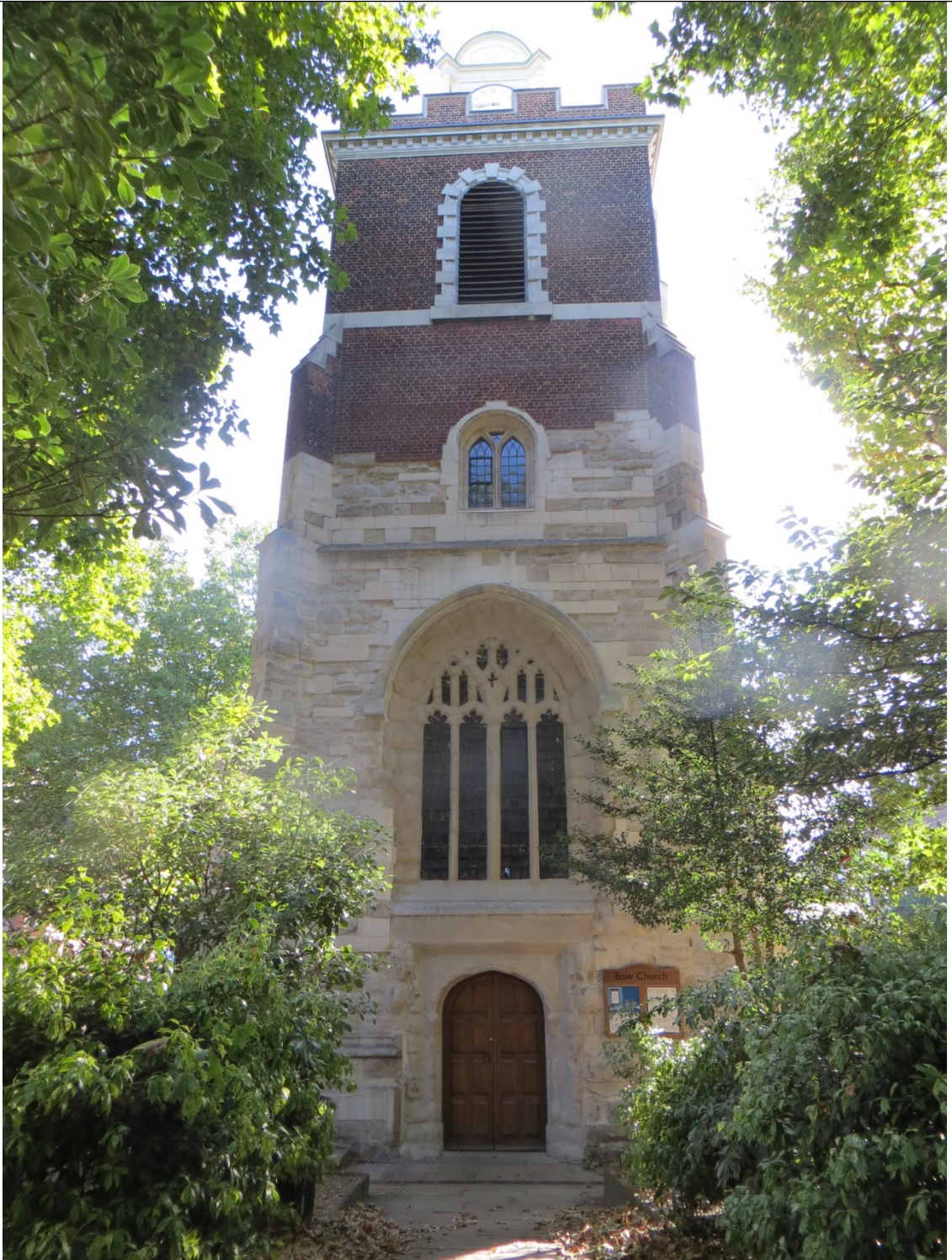
Fig. 1: The west tower and main entrance of St Mary and Holy Trinity Church